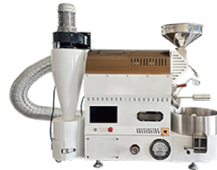
1kg touch screen