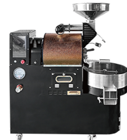
3kg touch screen